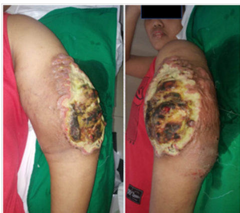
Figure 1 Clinical presentation of patient.