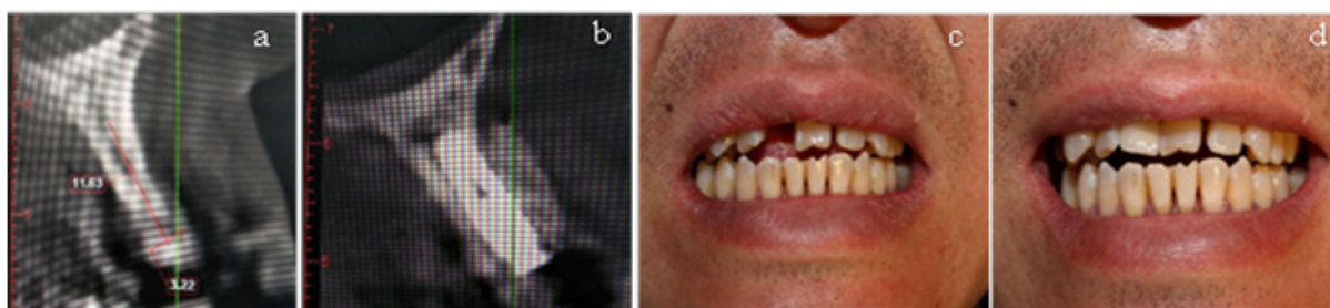
Figure 1 (a) CBCT of preoperation. (b) CBCT of postoperation. (c) Clinical photograph of preoperation. (d) Clinical photograph of 6 months after the operation.

A 48-year-old male patient settled in the plateau area, with a chief complaint of implant denture restoration. The maxillary right lateral incisor of the patient was removed due to periodontitis. (Health status: smoking for 21 years, fasting blood glucose: 7.2mmol/L). Surgical approach: we made a midline incision on the edentulous alveolar crest, adding a vertical loose incision. Moreover, the full thick mucoperiosteum flap was developed. We placed an Osstem implant (3.3*10mm) after flap opened. The buccal bone defect was surgically treated by placing bone scraps and bone substitutes (Bio-Oss®) and covered with a resorbable collagen membrane (Bio-Gide®). Double-layer membrane technique was used to ensure longer barrier function (Bosshard and Schenk, 2010). CBCT showed preoperative and postoperative results (Figure 1a) (Figure 1b). Clinical photographs of preoperative and of 6 months after the operation (Figure 1c,) (Figure 1d).