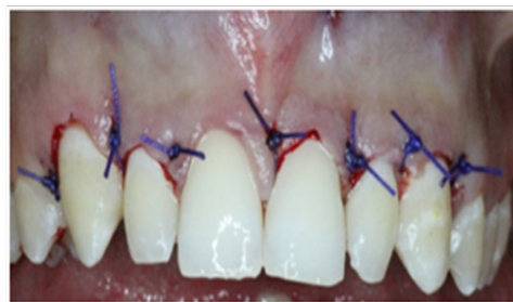
Figure 3 Intra oral images showing tooth size discrepancies.

Eventually, preparations were meticulously finished and polished by means of yellow- tapered- diamond bur and a rubber cup.