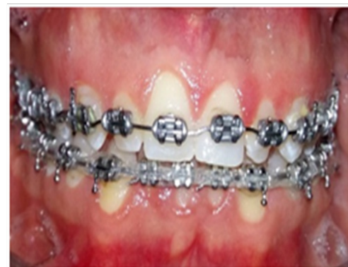
Figure 1 Preoperative view: final step of the orthodontic treatment.

No dental decay was detected. Neither was bone/root resorption. From a periodontal perspective, the patient has quite satisfactory gingival health. He has a stable posterior occlusion after the orthodontic treatment (Figure 1). Whenever esthetic procedures are considered, emphasis must be put on gingival health. Thus, brushing technique had to be optimized. Periodontal treatment, including scaling and root planning should be first realized.