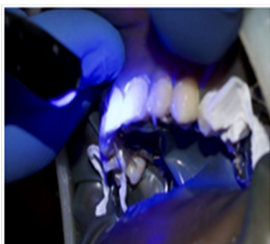
Figure 11 Photopolymerization.