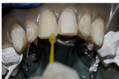
Figure 10 Adhesive agent application with a micro-brush.

Static and dynamic occlusion was scrutinized. Minor adjustments were realized by means of fine diamond bur. Finally, the margins of the bonded veneers were finished and polished. The patient was satisfied with both esthetic and functional outcome (Figure 11) (Figure 12).