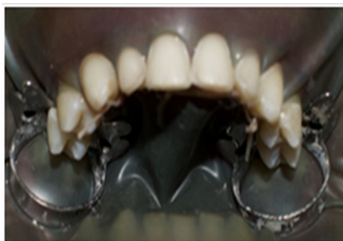
Figure 6 Rubber dam application.

The rubber dam, key to success to bonding procedure, was carefully positioned between the first two premolars to achieve adequate isolation (Figure 6). Extreme care was taken during the bonding protocol. The following sequenced steps were meticulously considered: