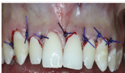
Figure 2 the gingivectomy from tooth #13 to tooth #23.

The patient underwent gingivectomy to re-establish the correct position of the gingival collars mainly the zeniths as well as the appropriate clinical length/width ratio of the six anterior teeth (Figure 2).