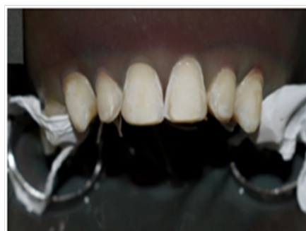
Figure 9 Frosty white appearance confirming well etched enamel.

Light curing composite resin was used for cementation. Veneers were seated starting from central incisors where a maximum of symmetry was required. Every veneer was gently positioned with finger pressure. Correct seating was ascertained by checking the marginal fits. Initial light cure lasted five seconds. Then excess of luting agent was removed. A final photopolymerization was performed for 60seconds on the buccal and lingual surface of each restoration (Figure 11). Residual cement elimination was thoroughly assessed by probing the crevicular sulcus. Dental floss passes with light friction.