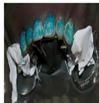
Figure 8 37% phosphoric acid application during 30seconds.