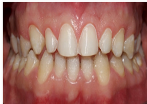
Figure 4 Extremely conservative tooth preparation within enamel from tooth #13 to tooth #23.