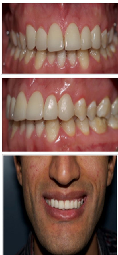
Figure 12 Final result: a: intra oral view, b: lateral view, c smile.