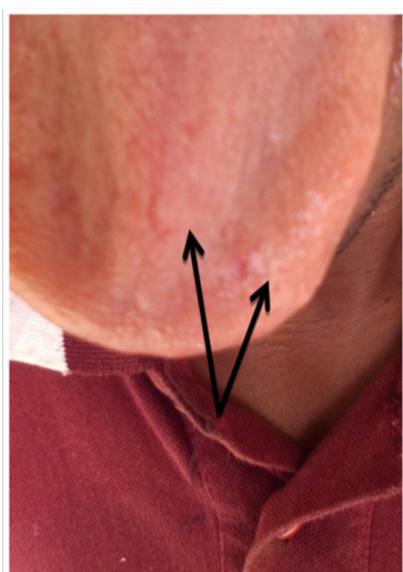
Figure 1 Black arrows indicate areas of multiple ulcers on the tongue.

An assessment of Behcet's disease was made based on the presence of recurrent oral ulcer (>3times in a year), recurrent genital ulcers and posterior uveitis as proposed by International Study Group on Behcet Disease. He was commenced on oral prednisolone 10mg bid, oral azathioprine 50mg bid and omeprazole 20mg b.d. The dose of the oral prednisolone was tapered off after 2weeks. He made significant clinical improvement as all symptoms resolved after 2weeks of treatment and complete resolution of symptoms was noticed after a month (Figures 1-3).