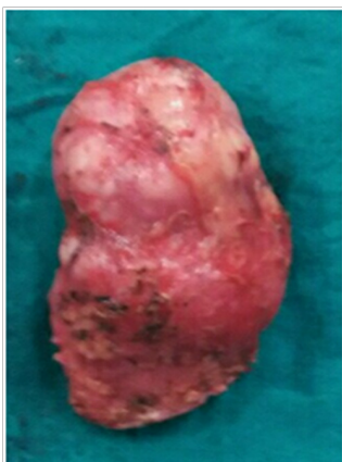
Figure 4 Excised Specimen well encapsulated.