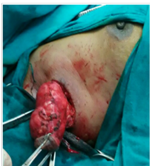
Figure 3 Giant Axillary Fibroadenoma being excised.