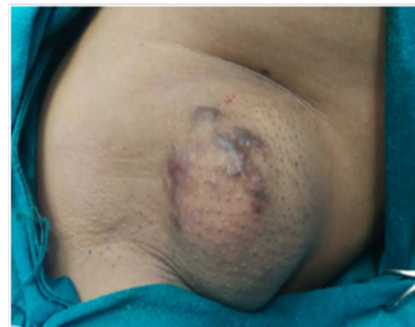
Figure 1 Preoperative photograph.

basophils-0/cmm, Bleeding time-2minutes, Clotting time- 5minutes, Blood urea- 30mg%, Blood glucose- 94mg%. Pre anaesthetic check up was done and patient was accepted for anaesthesia.