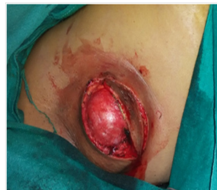
Figure 2 Peroperative photograph.

The patient was operated under general anaesthesia. Incision was given in skin and subcutaneous tissue. On undermining both flaps a solid mass started protruding from the incision (Figure 2). The size of this lump was 11cmx10cm (Figure 3). Haemostasis was achieved using electrocautery. The excised specimen had a well defined capsule similar to fibroadenoma of breast (Figure 4). The cut surface of specimen had a whitish lobular appearance (Figure 5). The histopathological diagnosis was confirmed as fibroadenoma. Microphotographs show intracanalicular type of fibroadenoma having plenty of stroma (Figure 6). The postoperative period was uneventful and stitch line was healthy after stitch removal.