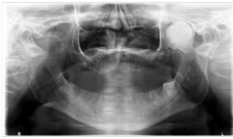
Figure 2 Panoramic radiography shows expanded irregularly shaped radiopaque lesion on the left coronoid process.