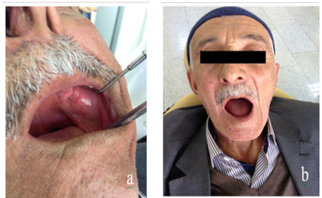
Figure 1 shows A) limitation of mouth opening B) deviation to the left side during the mouth opening.

A 69-year-old male patient referred to the radiology clinic of the Atatürk University with complaint limitation of mouth opening, with no evidence of pain or joint sound. There was no history of facial trauma and medical history was not significant. In clinical examination, limitation of mouth opening and deviation to the left side during the mouth opening was found in patient. Figure 1 Panoramic radiography showed expanded irregularly shaped radiopaque lesion on the left coronoid process. Figure 2 CBCT scan was performed. Three-dimensional (3D) reconstruction of the CBCT images showed a mushroom-shaped hyperplastic enlargement of the coronoid process which causes resorption under the bones of the skull base. Figure 3 The size of the lesion was measured 33,1x25,5x30,2mm. Patient was referred to the surgery clinic with the prediagnosis of osteochondroma.