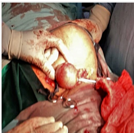
Figure 3 Incidental findings of unilateral ovarian cyst (Case 5).

of labour pain. Her antenatal period was uneventful. She delivered a 3.0kg infant by emergency cesarean section due to fetal distress. The baby was transfer to SCBU (special care baby unit) for observation due to transient tachypnea. Upon examination of adnexa after delivery of the baby, a 6x6cm diameter mass (Figure 3) originating from the right ovary was found and cystectomy was done. Clinical diagnosis was suggestive of dermoid cyst. Histopathological results confirmed that the mass was a mature cystic teratoma (dermoid cyst).