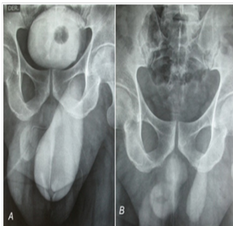
Figure 1 A. Excretion Urography showing urinary bladder incarceration. B. Post void view with residual urine in herniated bladder.

Renal, bladder, inguinal and testicular ultrasounds were practiced and reported: Bladder displacement by left inguinal canal and scrotum. Both kidneys, ureters and testis with normal characteristics. For the high suspect of urinary bladder as the acute renal failure origin a retrograde cystogram was scheduled, finding in filling plate contrast material in urine bladder with 90% displacement to the scrotum by left inguinal canal (Figure 1A). In post voiding projection residual urine is observed in left scrotum (Figure 1B).