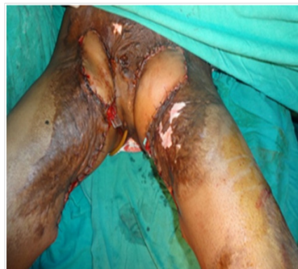
Figure 3 Per-operative picture showing the septocutaneous perforator.