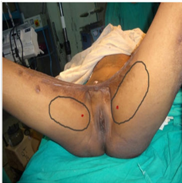
Figure 5 Result at 1 year follow up.

The flaps survived on both sides without any complication, and there was no donor site morbidity. The functional results are satisfactory at one year follow up (Figure 5) and there has been no contracture recurrence to date.