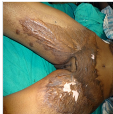
Figure 6 Colour Doppler examination in healthy volunteer showing the perforator at the medial border of gracilis about 5 cm below the pubic tubercle.

The medial thigh fasciocutaneous flap is a transposition flap described by Wang et al., 7 based on the presence of a communicating suprafascial vascular plexus in the medial thigh. Turley et al., 4 reported lateral transposition of the same flap to release post-burn groin contractures. The flap described in the present article is a novel fasciocutaneous island flap having a unique vascular basis different from the flaps previously described. Our flap is based on a dominant septocutaneous perforator in the inner medial thigh, located about 5 cm below the pubic tubercle at the medial border of gracilis. The perforator was found in the same location bilaterally with the help of Doppler, thus enabling a single-stage reconstruction of groin contracture on both sides, with satisfactory functional outcome. Colour Doppler examination in healthy volunteers also revealed the presence of a perforator in the above location (Figure 6).