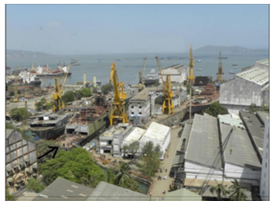
Figure 4 Facility available at GRSE.