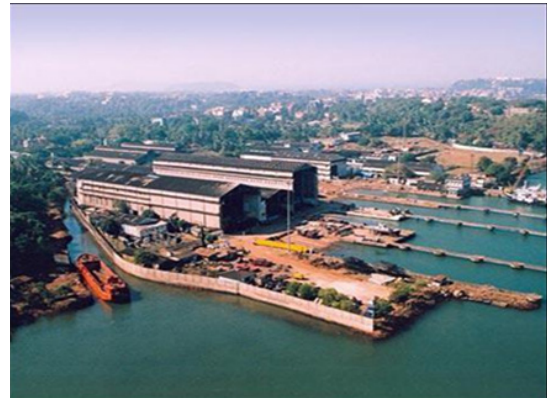
Figure 3 Facility available at Goa shipyard.

A study has done on the facilities available at Goa Shipyard & GRSE. Those information has used during design stage of the layout. Beside this few reference books & soft survey data also used for the above purpose (Figures 3,4).