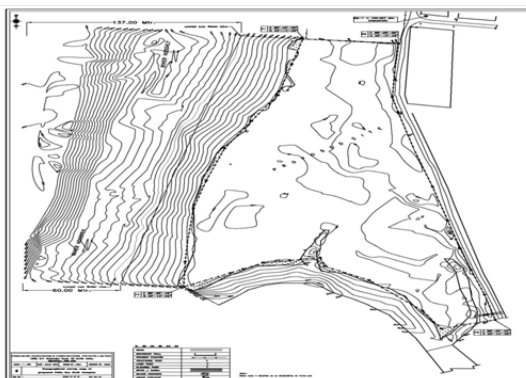
Figure 2 Survey drawing.