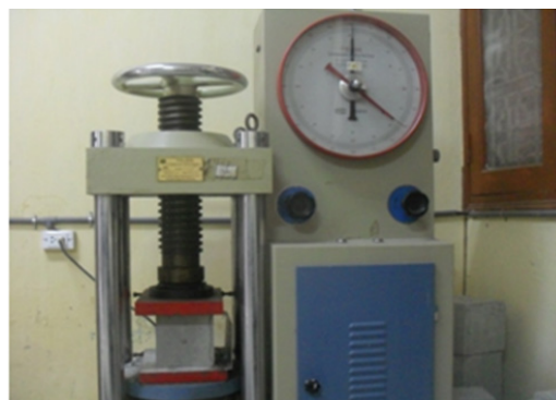
Figure 2 Hydraulic press machine for determining concrete strength.

The determination of the strength of concrete is performed according to Vietnam standards using concrete samples in cube shape with size 15x15x15cm. The hydraulic press machine used for determining concrete strength is shown in Figure 2.