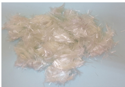
Figure 1 Polypropylene fibre.

Aggregate: Fine aggregate used for this study is sand in Red river; the sand was locally available in Sontay district, Hanoi city, Vietnam. Coarse aggregate is produced from local sources at Hoathach area, Quocoai district, Hanoi city, Vietnam. Technical properties of fine and coarse aggregates are in accordance with Vietnam Standard. 12 Water: water used for mixing the concrete is as per the recommendation in Vietnam Standard. 13 Fibre: The used fibre is Polypropylene. Picture of the polypropylene fibre is shown in Figure 1, and its properties are shown in Table 2.