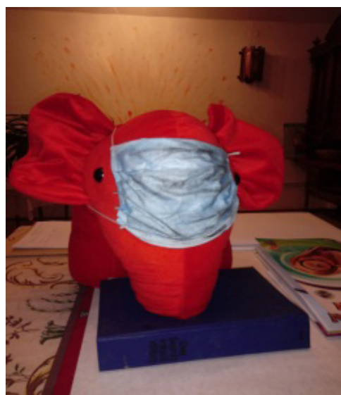
Figure 3 Employee after 3 hours of work.