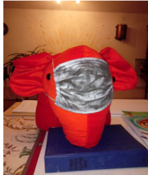
Figure 4 Employee after 6 hours of work.