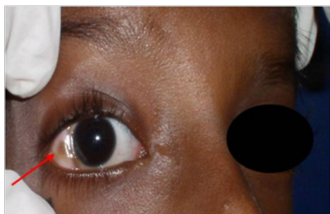
Figure 4 Ocular changes showing dermoids in the conjunctiva of left eye.