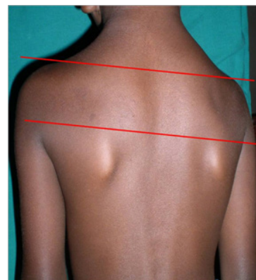
Figure 1 Altered posture as the shoulder levels were not at same level.

mixed dentition (Figure 5) and the lateral cephalograph revealed malar and maxillary hypoplasia (Figure 6). We diagnosed the patient as a case of Goldenhar syndrome on the basis of multiple accessory tragi, ocular dermoids, hypoplastic malar process, facial nerve paralysis, mental retardation and skeletal abnormalities. Patient was referred for auricular surgery followed by ear prosthesis replacement.