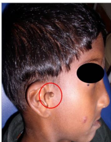
Figure 3 Accessory ear tags in the preauricular region on right side.