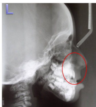
Figure 6 Lateral cephalograph showing hypoplastic malar and maxillary bone.