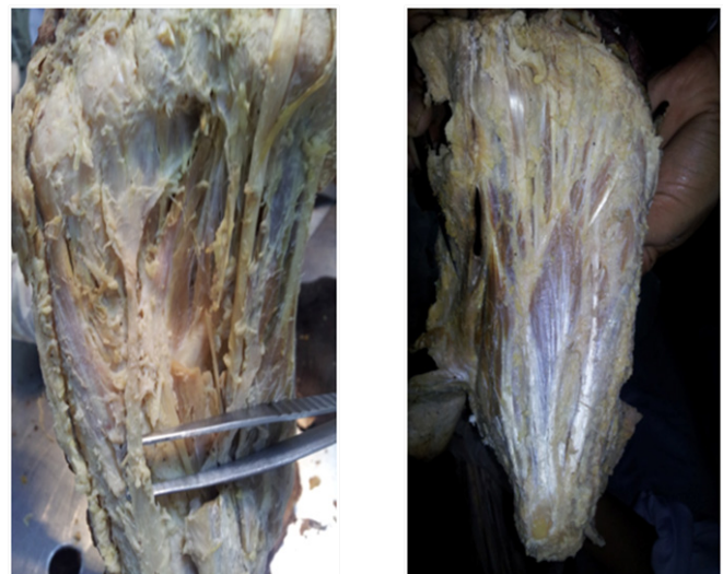
Figure 1 & 2 B/L abductor ossis metatarsi digit quanta (marked with arrow).

ADM (abductor digit minima) on tuberosity of fifth metatarsal 4 or to middle or anterior part of fifth metatarsal, prevalence found to be 40%. 5 Our case slip reached up to anterior part of 4 th & 5 th metatarsal. Flexor digitorum braves lies immediately deep to central part of plantar aponeurosis. It arises by a narrow tendon from the medial process of the calcanean tuberosity and intramuscular septa between it and adjacent muscle. It usually divides into 4 tendons for lateral four toes, each slip divide at proximal phalanx and attaches to side of middle phalanx, thus forms tunnel for FDL. In our study we found 3 digitations of FDB, slip to fifth toe was absent (Figure 3) (Figure 4). The slip to given toes may be joined by supernumerary slip or be absent. Nathan and Globe 2 found the slip to the fifth toe to be most susceptible for such variation (63%), Bergman et al., 6 Yalcin and Ozan 7 and Lobo et al., 8 Ilayperuma I. 9 Those to third or fourth less so (10%) that to second almost invariable.