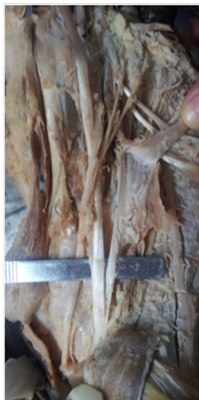
Figure 5 U/L (Lt side) additional slip of FHL to FDL (at knot of Henry).

Flexor Hallucis Longus arises from the distal 2/3 of post surface of fibula & adjoining interosseous membrane. FHL tendon grooves the post surface of lower end of tibia, talus and inferior surface of sustentaculum tali of calcaneus. FHL tendon reaches to the interval of sesamoid bone under head of first metatarsal then gets inserted at base of distal phalanx. In sole of foot FHL crosses FDL superiorly from lateral to medial side, at the crossing point (knot of Henry, the long digital flexor receives a strong fibrous slip from FHL tendon. The connecting slip to FDL varies in size, it's usually continues into the tendons for the second & third toes, but sometime restricted to second and occasionally extends to the fourth. In our study all four of left foot toes received digitations from FHL along with FDL (Figure 5).