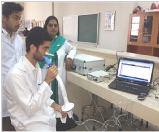
Figure 1 Pulmonary function tests are being performed using power lab in physiology laboratory of Shalamar Medical and Dental College, Lahore.

student productivity by applying independent learning techniques to a group of human and animal physiological experiments (Figure 1).