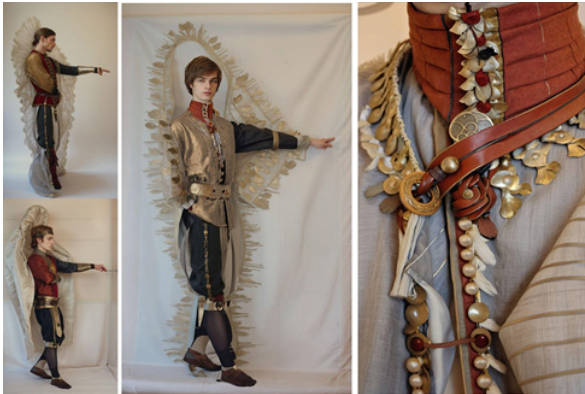
Figure 6 costumes, layers and body-assemblages constructed from the original drawings and data of O Trono Ballet.

during the material selection stage can serve as a basis for the digital collage formulation, whether in image editing tools or as keywords generated by AI (Figure 6).