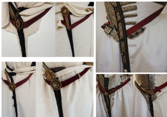
Figure 7 AI experimentation with variations in decor and adornment of garments in collars and necklines, studies made from the silhouettes, colours and details of the shapes of characters from O trono.