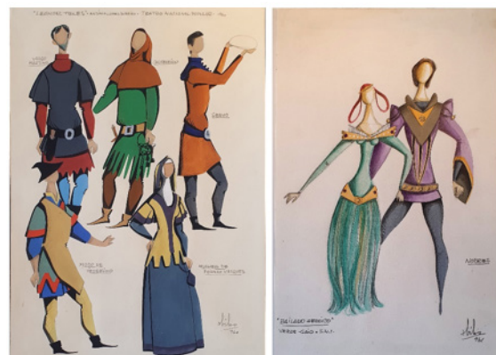
Figure 2 costumes by Abílio de Mattos e Silva, (left) Leonor Teles play by Teatro Nacional Popular (right) 181598-A Nobres, MNT 181392-A characters by O Condestável Ballet, by Companhia de Bailados Verde Gaió.