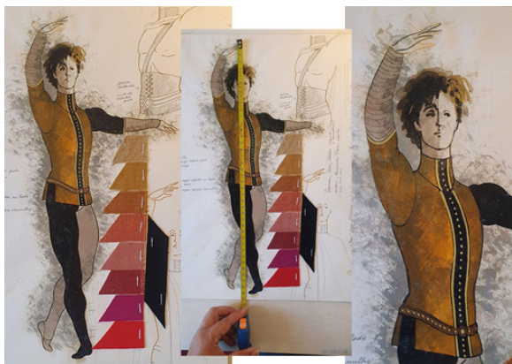
Figure 4 In: 204602, Fidalgos do Séquito, 1970, Grupo de Bailados Gulbenkian, figurino de Artur Casais.