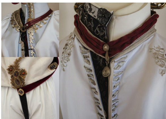
Figure 8 AI experimentation with ornaments and embroidery created from details of O trono drawings.

“The Digital systems are fluid, in that bits can be recycled for use almost indefinitely, and constructible because while their organisation is variable and provisional it is definable by coding in computer programming languages”, 8 the fluidity of the dates helps us to get better result on the processes, because we can reuse the same image as foundation and recycling some type of generation more adapted