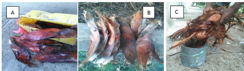
Figure 1 Procedures of palm leaf sheath preparation for extraction A) Harvested leaf sheath B) Soaked leaf sheath C) decorticated fiber.

As shown in Figure 1 palm leaf sheathes swell when soaked so that decortications of the sheathes will be easier.