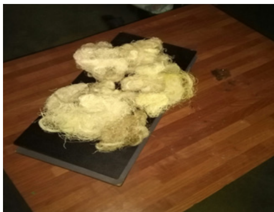
Figure 3 Peroxide Bleached palm leaf sheath fiber. The whiteness of the fiber is due to bleaching effect.

Softening treatment of palm leaf sheath fiber: Sample cluster of bleached fibers taken out and kept to characterize longitudinal, tensile and elongation of the bleached fiber. The other fibers treated with silicone emulsion softener followed by steaming and then dried.