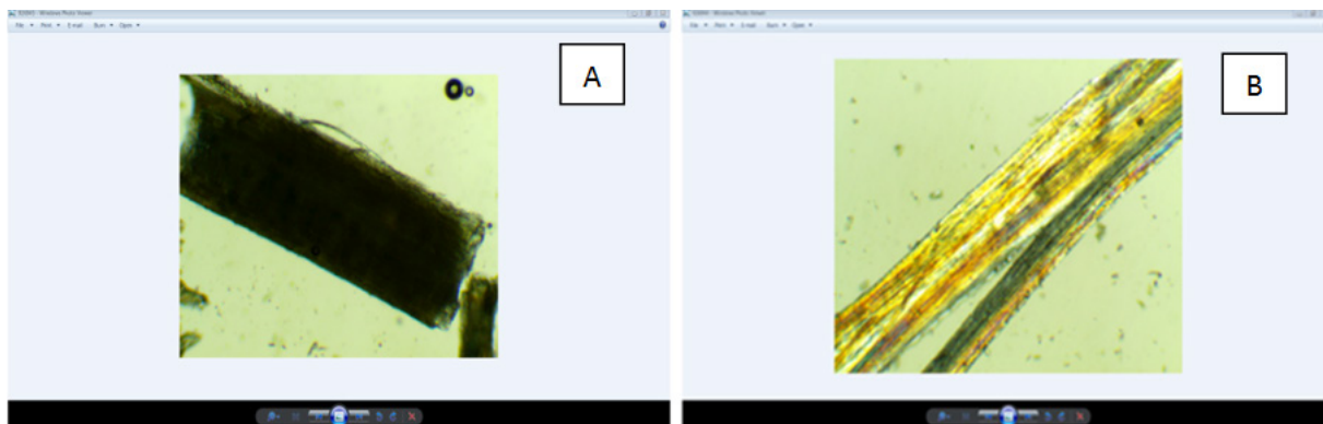
Figure 4 Longitudinal view under scanning electron microscope. A) un softened B) softened fiber. In fig4b Due to softening the palm leaf sheath fiber got a cylindrical shape.

Figure 4 revealed softening the palm leaf sheath fibers improved fiber orientation and changed the random oriented of the fibers. In Figure 4A the fiber seems more amorphous. After softening Figure 4B the fibers were oriented and due to the orientation of the fibers the fiber cross-section became cylindrical.