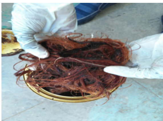
Figure 2 Raw palm leaf sheath Fiber extracted by chemical degumming. The raw fiber has reddish yellow color and its sticky.

As it is clear from Figure 2, the color of raw fiber extracted from palm leaf sheath by chemical degumming is reddish yellow and the raw extracted fiber is sticky.