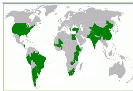
Figure 3 Countries growing organic cotton. 7

Organic cotton cultivation is a well-known old cultivation where only natural fertilizers or registered/controlled list of chemical fertilizers are allowed to be used on the land and its neighboring area. Practically organic cotton growing countries in the world are listed Table 2 and shown in the world map, Figure 3.