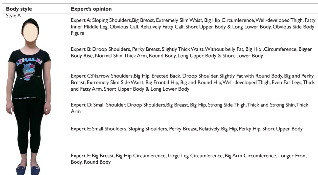
Table 1 The Features of the Body Style

At this stage, the clustering analysis was carried out based on the above correlation coefficients to determine how to classify each research subject's body style. Then, representatives were selected from each body style cluster and characteristic differences of the body style clusters were compared. Aimed to gain the best clustering analysis results, clusters were formed based on repeated tests using Wards' clustering analysis method and the results were demonstrated with a dendrogram. After selections, 4 clusters were finally confirmed and shown in Table 1. There were 6 experts invited to have a focus group interviews on the representative research subjects of each body style cluster to select the important measurement items of the body style. The result of which is shown in Table 1. In the end, based on the consensus of the experts and fuzzy Delphi method, 5 the important measurement items for determining body styles were confirmed. The measurement items with De-fuzzy number less than 6.5 were deleted. Then, the body measurement indicators of the body style were established. The results are shown in Table 2.