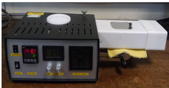
Figure 2 Sensora Permatext water vapour permeability apparatus.