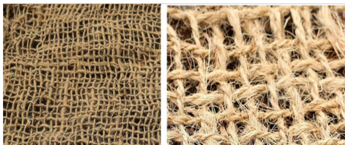
Figure 1 Jute and Coco based geotextiles: (ECOBIOTEX: www.ecobiotech.fr).