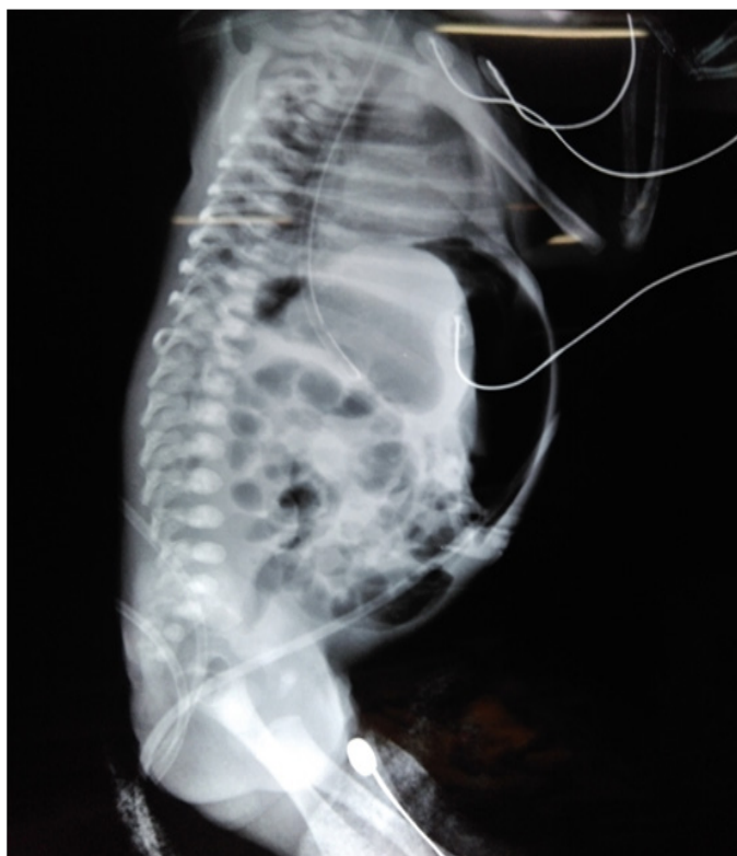
Figure 2 Perforation in the meconium cyst and hepatic flexure of transverse colon communicating with the cyst.