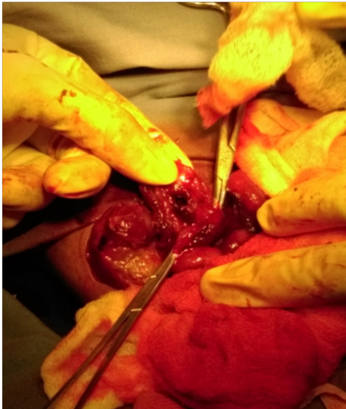
Figure 3 Mucosal stripping of the colon densely adherent to liver.