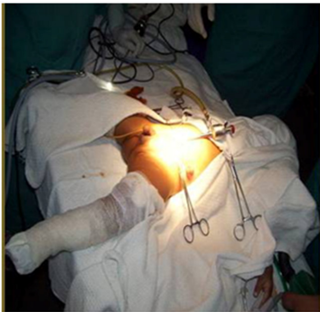
Figure 1 Patient positioned across the table with body draped from below the nipple.

weight) was infiltrated at the proposed port insertion site. First 5mm mm port was placed by open technique through the umbilicus. The capnoperitoneum was created at initial flow rate 2 lit/min to maintenance rate at 5 lit/min. Our maximum level for intraabdominal pressure was 6 mm of mercury, below six months of age; from 6 to 8 mm of mercury from six months to twelve year and 10 mm of mercury beyond twelve years. Continuous capnography was done to kept the end expiratory carbon-di-oxide concentration below 32. Inspection of the peritoneal cavity was done. The 2nd and 3rd 3 mm ports were placed under laparoscopic guidance. Usually these ports were in right and left flank, 6 cm away from midline and 2.5 cm above the transverse umbilical plain. In young infants the accessory instruments can also placed transcaneously (without port).