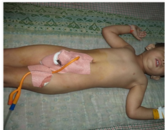
Figure 4 The dressing policy.

Devascularization of the flap or graft is a major complication and reported incidence is 7%. Various causes of devascularization are damage to vascular supply while raising the flap, hematoma, infection, vascular spasm, and tight pressure dressing. The necrosis may be superficial and dermal (commonly seen due to pressure dressing) and heal without permanent damage. The viability of the neourethra can be evaluated by simply looking at the outer face of the flap in case of double island flap urethroplasties. It can be prevented by proper graft design, good surgical technique maintaining the proper plane of dissection, good hemostasis to avoid hematoma, administration of broad spectrum antibiotics to prevent infection, avoiding tight dressings, local application of nitroglycerin ointment to prevent vasospasm and counter incisions. If any part of graft or