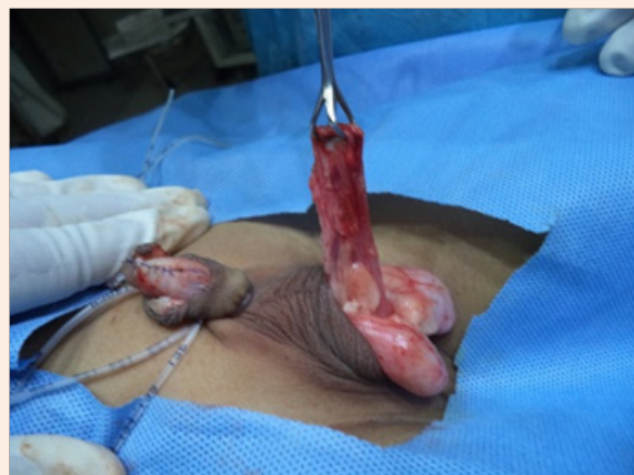
Figure 1: Dartos Flap raised from the scrotum.

2) Dartos Flap (Figures 1&2) raised from scrotum. It is robust, has excellent blood supply and gives support and protection to suture line avoiding fistula formation [15]. The dartos flap is fibroadipose tissue between the scrotal skin and tunica vaginalis with its vascular pedicle based at the penoscrotal Junction. The flap reaches the distal penile shaft without tension. Dartos is a vascular tissue which helps in healing. In case of fistula formation, this vascular tissue promotes healing and majority of fistulae heal without requiring a redo surgery. Dartos flap can also be raised from the prepuce but it has poor blood supply and it and the associated skin can get necrosed [15,16]. Dartos flap to protect tubularized incised plate urethroplasty is safe with a low complication rate. The neourethra is covered entirely with a layer of vascularized tissue and is good choice for preventing urethrocutaneous fistula formation [17]. A large multicentric study involving 394 patients shows a drastic reduction in complications of hypospadias surgery after a Dartos flap with following results. Out of 394 patients complications occurred in 23 patients (5.83%): fistulas 1.01% (4 cases), stenosis 0.25% (1 case), mild stenosis 2.53% (10 cases), dehiscence of ventral cutis 0.50% (2 cases) and penile torsion 1.26% (5 cases). All fistulae had a spontaneous resolution [17].