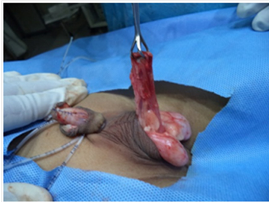
Figure 1 Dartos Flap raised from the scrotum.

Urine flows in force and pressure that can easily disrupt mucosal level of healing that occur at the end of one week. Collagen is laid down at the end of a third week which gives strength to the suture line. Just adding suprapubic diversion dropped the fistula rate by about 50%. 18,19 Recently there is a trend of avoiding suprapubic diversion which has no scientific rationale. Suprapubic diversion shall be necessary till we have a breakthrough in wound healing where three weeks healing can be preponed in one week. I had many patients who did not have fistula initially but developed after one week or so. It proves that although initially there is no fistula, due to the force and pressure of urine it develops afterwards by disrupting the mucosal level of healing without collagen to support it. The following study on 105 patients had complications such as fistula and meatal stenosis significantly less in a group in which suprapubic diversion was used. In 56 of the 105 patients in whom suprapubic diversion was used, four (7.14%) had fistulae and three (5.35%) had meatal stenosis, in contrast to a fistula rate of 14.28% and meatal stenosis rate of 12.24% in patients that urethral stent is used for urinary drainage. It proves that the use of suprapubic diversion is advantageous for the outcome of one stage hypospadias repair in relation to fistula occurrence and meatal stenosis. 18