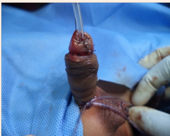
Figure 3: Photo showing completed repair.

In another randomized clinical trial out of 192 patients, fistula was reported in eight patients (12.7%) of urethral catheter group A, while it was observed in three patients (2.3%) of suprapubic diversion groups B. Meatal stenosis was reported in eight patients in group B (12.7%; nonstented group) versus three patients of both groups A (2.4%; stented groups) with a statistically significant difference ( p < 0.05 ) [19]. It proves that Suprapubic diversion is an important step in hypospadias repair as it provides a better success rate with a significantly lower rate of occurrence of fistula. 4) Rotating total prepuccial skin instead of Byars' skin flaps. It is Popularized by Dr. Asopa and Dr. Duckett in 1970 (Figure 3). Dorsally cutting the prepuccial hood can jeopardize the blood supply of either of skin flaps and it can get necrosed leading to failure of the operation [20,21]. Another problem is that suture line of urethra crosses with the skin which is a violation of basic principles of surgery. It leads to a higher chance of fistula formation [20]. In the following study, Byars' method was used in 8 of these to cover the defect and the Ombredanne method in the remaining 2. Necrosis developed in the skin flap of 5 cases (50%) (4 Byars and 1 Ombredanne). Urethral fistula developed in the other patient whose necrosis was deeper. The mean hospital stay was 7 days for patients without necrosis and 14 for those with necrosis (between 13 and 15 days) [20,21].