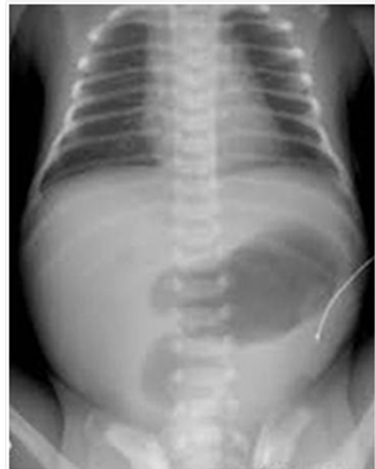
Figure 1 Erect X-ray abdomen showed dilated stomach with paucity of gas in lower abdomen and pelvis.

On tenth day of life, he developed feeding intolerance and per rectal bleeding. A soft to firm lump of about 2×3 cm in size was palpable in the right hypochondriac region. Nasogastric tube aspirate was bilious. Erect X-ray abdomen showed dilated stomach with paucity of gas in lower abdomen and pelvis (Figure 1). Dye study done for confirmation of diagnosis showed the same picture i.e. only gastric shadow could be visualized. Ultrasonography of the abdomen showed dilated, peristaltic bowel loops. Haematologic investigations showed raised WBC counts of 16,000/cmm and low Platelet count of 100,000/cmm. The differential diagnosis was malrotation with volvulus or necrotizing enterocolitis. In view of poor general condition, the child was explored under local anaesthesia. He had characteristic black-velvety gangrene confined to middle 8-10 cm of the mid-transverse colon without any frank / impending perforation. Initial 5-7 cm of mid-transverse colon from the hepatic flexure was normal. Rest of the colon and small bowel was healthy looking. The non-viable colon was excised. After resection, the free ends were brought out as colostomy and mucus fistula through either end of the incision. Blood loss of about 20 cc was replaced on table. Post-operatively the activity improved. Nasogastric feeds were started on post-operative day three, once colostomy was functioning. Initially they were well-tolerated.