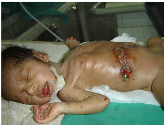
Figure 3 Neonate in NICU with functioning colostomy. Note superficial wound gape.