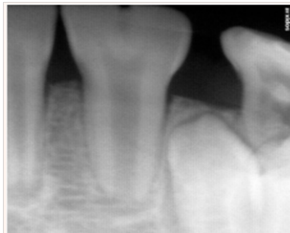
Figure 4 Periapical radiograph showed that the connated incisor had a single root and single pulp canal and absence of permanent lateral incisor tooth bud.

Hussein and Abdul Majid 21 analysed 65 children with dental anomalies in the primary dentition and noted 75% cases with double teeth, 94% were fusion and 6% were gemination. The anomalies of permanent dentition are strongly associated with that of the primary dentition. They also stated that the presence of double teeth in primary dentition is associated with anomalies in 60% of cases. Brook and Winter 9 reported that half of the primary double teeth have an anomaly in the permanent dentition.