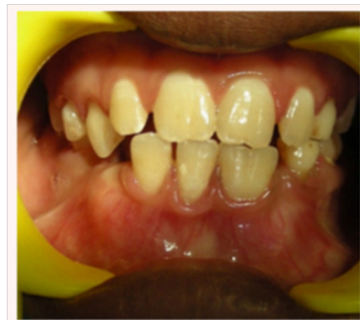
Figure 1 Intra oral picture showing teeth in occlusion.

the lower left front region of the jaw (Figure 1). The boy was not concerned about the aesthetic appearance. The medical and family histories were not significant. Extraoral examination did not show any alterations. Intraoral examination revealed an early mixed dentition period with the presence of one large incisor that was abnormally wide on the left side of the lower arch (Figure 2 and 3). The child had 20 teeth and normal eruption pattern and occlusal status was evident. The double tooth presented a groove upto the cervical third of the crown and hypoplasia on the labial surface (Figure 4). Periapical radiograph displayed the connated incisor with a single root and single pulp canal (Figure 5). The orthopantomograph revealed the presence of double tooth along with the absence of lower left lateral incisor (Figure 6).