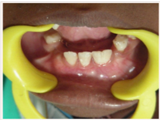
Figure 2 The mandibular arch showing the connated tooth.

use of Levitas classification to distinguish between cases of fusion and gemination is very practical. 10 Counting the number of teeth in the arch 11,12 or observing the root morphology 13 are also considered. It is difficult to diagnose based on the number of teeth because nothing impairs the fusion between a normal and supernumerary teeth while the contiguous normal tooth is congenitally absent, resembling clinical cases of gemination. 14 It is very difficult to distinguish the differences between them if they don't have clinical relevance. 15 Sometimes both fusion and gemination are used as 'synonyms' 16,17 or simply as 'connated teeth' 18 or 'double teeth'. 19