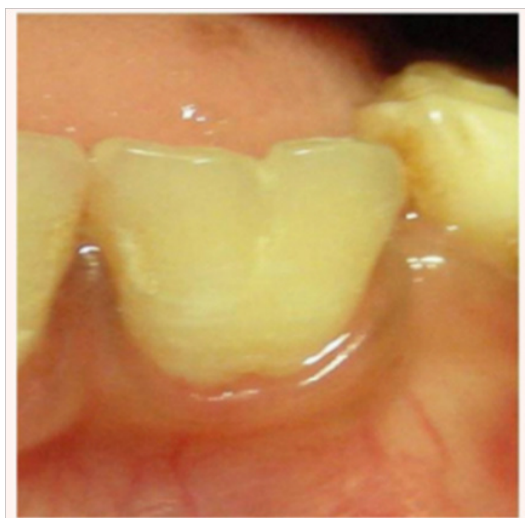
Figure 3 Close up view of connated teeth showing a groove that extends up to the cervical third of the crown.

The case presented could be considered typical, showing clinical characteristics of gemination of 31 and agenesis of 32. The radiographic appearance of single root and single pulp canal and the presence of one tooth less on the left side of the lower arch confirmed the diagnosis. This could be related to attempted splitting of the tooth bud in 31 and congenitally missing bud in 32 regions. Tooth agenesis is one of the most common craniofacial malformations of the permanent dentition with 20% prevalence. Kolenc-Fuse 20 observed that mutations were responsible for some patterns of tooth agenesis.