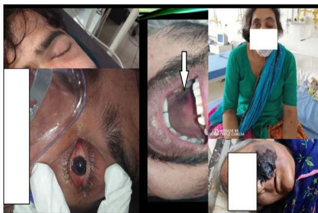
Image 1.1 Clinical features of mucormycosis. Clockwise: Facial swelling, oral cavity eschar, eye swelling, facial eschar, congestion, diminished vision and ptosis of eyes.