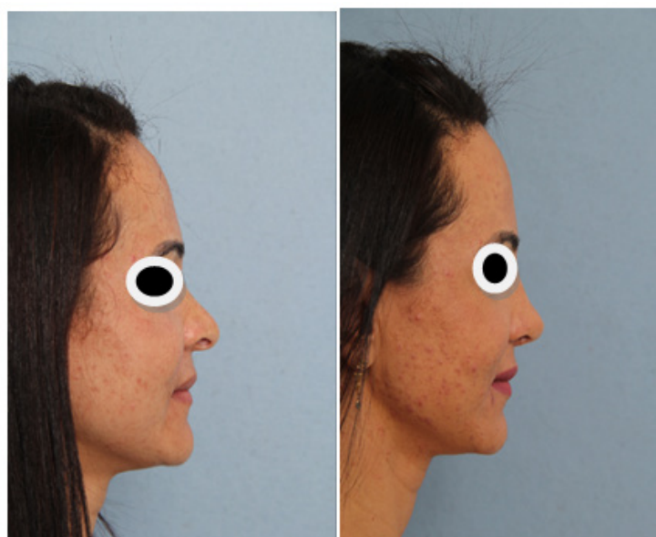
Figure 2 Profile view in the preoperative period (A); profile view in 5 months postoperative period.