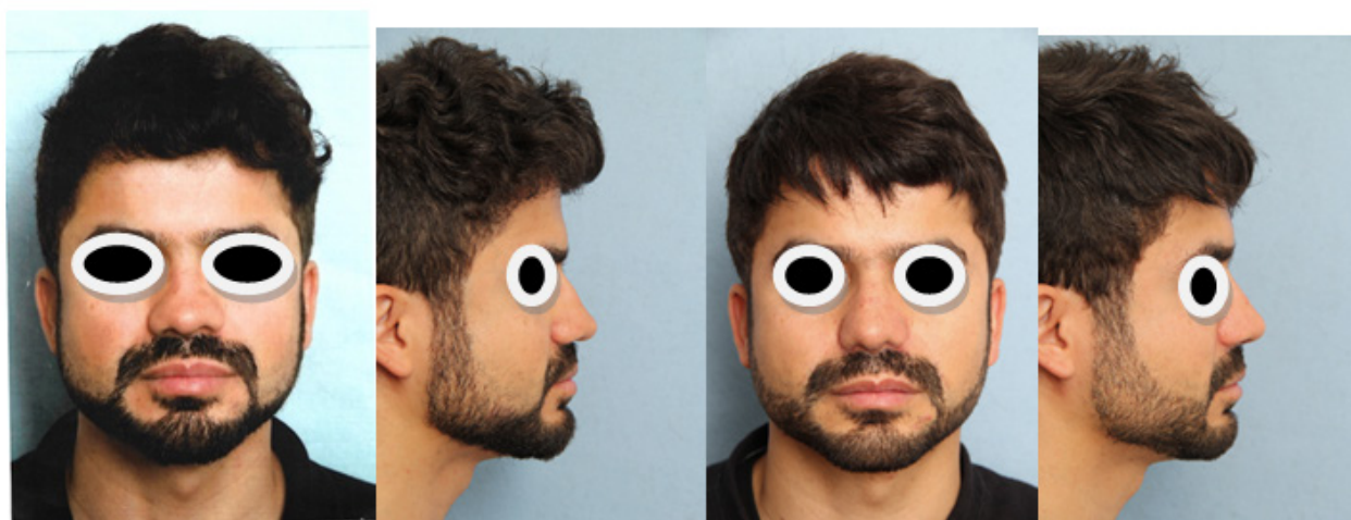
Figure 3 frontal and profile view in the preoperative period (A and B); Frontal and profile view with 1 month into the postoperative period.