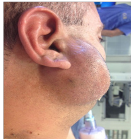
Figure 1 Facial mass at the right side of the angle of mandible.

Ultrasound-guided soft tissue mass biopsy, 5 passes an 18 G x 20 cm needle were made into the target mass showed neoplastic cells are positive for Pan-CK, S100, and focally for CK5/6. While they are negative for CD31, P63 and SMA. Mucicarmine highlights intracellular mucin. Perl's stain for iron highlights hemosiderin pigment. Feature of low grade mucoepidermoid carcinoma in right parotid gland. Based on the clinical evaluation and imaging we staged the tumor as T3N0M0.