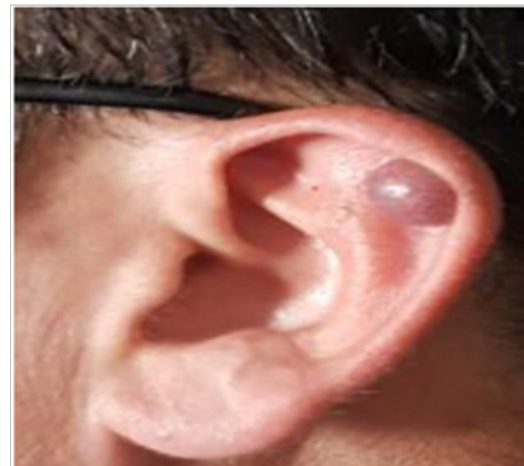
Figure 1 Preoperative appearance of a mass on the left auricle.

anywhere in the skin or subcutaneous tissue, and account for 5% of all benign neoplasms of soft tissues. The tumors are usually small (2 to 15mm), solitary, round, firm, skin-colored, and well-encapsulated. They present commonly between third and fifth decades of life. 1,2