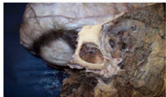
Figure 2 Cadaverous dissection, lateral view showing sigmoid section of the lateral sinus in a mastoidectomy.

For this we used cadaveric dissection of adults preserved in Montevideo Solution (4% formaldehyde solution). The cranial vault was removed with Stryker saw and the posterior fossa was discovered resecting the posterior sector of the occipital bone to the foramen magnum (Figure 1). The mastoid is then drilled to reveal the lateral sinus (Figure 2).