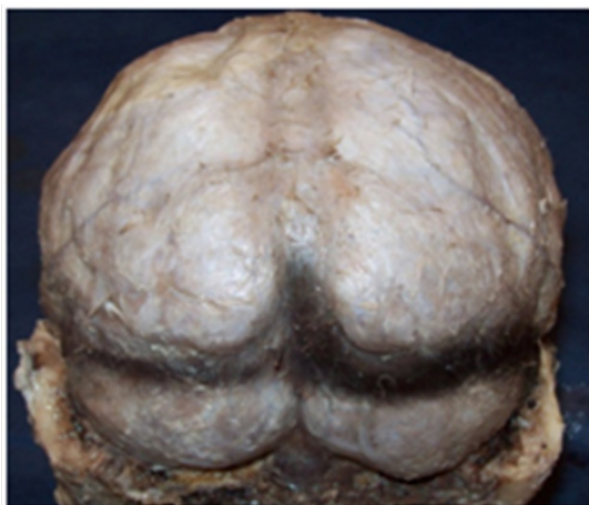
Figure 1 Cadaveric dissection. Posterior view of the head without the cranial vault showing dura mater in supra and infra tentorial floors and the origin of the lateral sinuses at the level of the confluence sinnum (Prensa de Herofilo).

Intra-cranial complications usually evolve in a continuous pattern, starting with meningeal irritation and suppurated collections and finally progressing to cerebritis and cerebral or cerebellar abscess. In evolved cases it's normal to find thrombosis of the sinus durae matris starting in the lateral sinus that can advance into the other sinus durae matris generate thrombosis of the internal jugular vein. 1