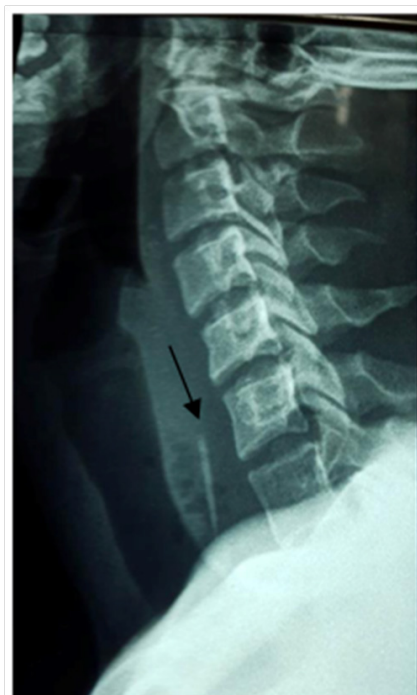
Figure 3 C-ray showed foreign body at c6c7.