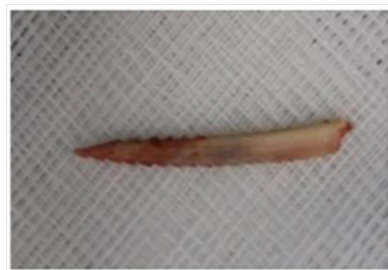
Figure 4 Fish bone.