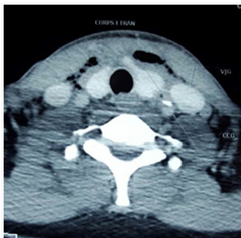
Figure 1 A cervical x-ray and a CT-Scan showed the foreign body between jugular vein and carotid.