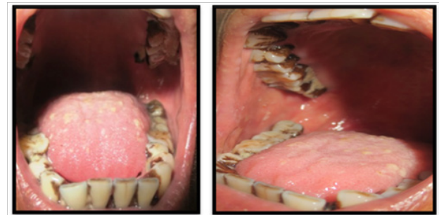
Figure 4 & 5 Shows Post-treatment view of tongue, hard and soft palate and buccal mucosa.

induced pseudomembranous candidiasis was made. The patient was advised to follow strict oral hygiene measures and he was also asked to use spacer along with metered dose inhaler (MDI) while using steroid inhaler with topical application of clotrimazole 1% mouth paint around 4-5 times per day for about 2 weeks. The patient was reviewed after 15 days where he presented with complete remission of the lesions (Figures 4 & 5).