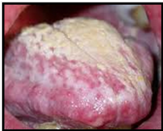
Figure 2 Shows curdy white coat on the tongue.