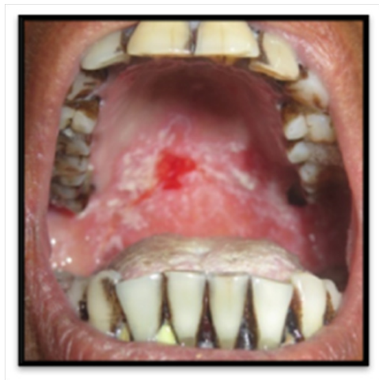
Figure 1 Shows the erythematous region in the palate.