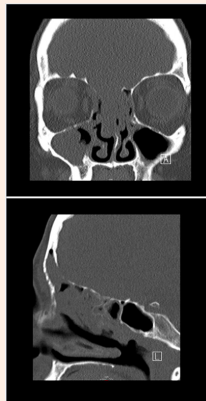
Figure 1: Contrast-enhanced CT-Scan showing a large nasal cavity tumor.

often incorrectly thought to be post viral or idiopathic. Scott et al. found a significant number of patients with sinonasal diseases inadequately diagnosed with post-URI olfactory loss. It is then imperative to collect a correct patient's history and to perform an accurate clinical examination [2,3].