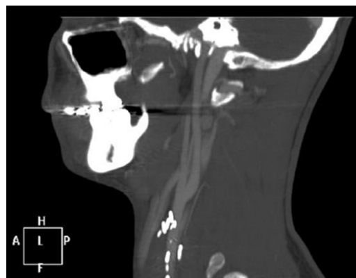
Figure 3 Sagittal reconstructed Computer Tomography carotid angiogram demonstrates an oval shaped homogeneously enhancing mass posterior to the left internal carotid artery.