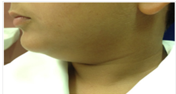
Figure 2 Left side neck.