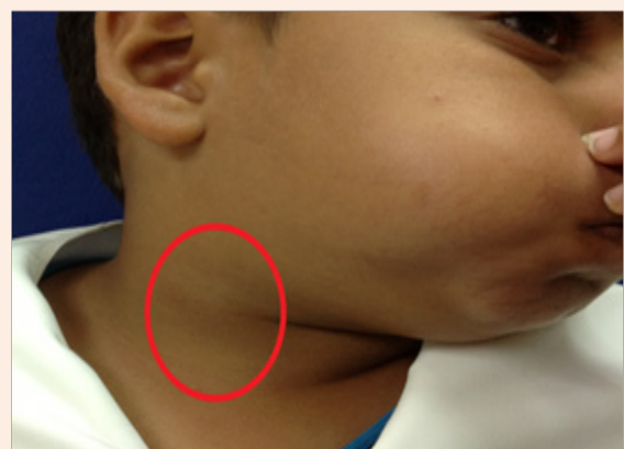
Figure 1: Right neck mass appears when the child performs Valsalva manoeuvre.

neck anterior triangle and posterior to the SCM muscle (Figure 1). On palpation there was fullness in the right side anterior triangle of the neck which was pushing the SCM slightly anteriorly. The mass was about 4x5 cm, smooth surface with well-defined anterior surface, not warm, not tender, and not pulsatile. The mass completely disappeared when the child is relaxed. On the other side of the neck there was no swelling appreciated (Figure 2). Computed tomography revealed dilatation of right internal jugular vein, more toward the inferior part of the vein. There was no mass causing compression or obstructing the drainage of the vein (Figure 3).