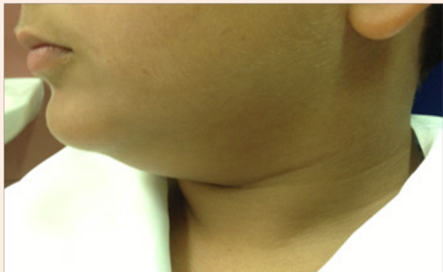
Figure 2: Left side neck.