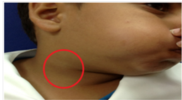
Figure 1 Right neck mass appears when the child performs Valsalva manoeuvre.

other side of the neck there was no swelling appreciated (Figure 2). Computed tomography revealed dilatation of right internal jugular vein, more toward the inferior part of the vein. There was no mass causing compression or obstructing the drainage of the vein (Figure 3).