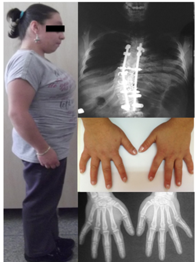
Figure 1 Phenotypic features of the patient.

and sensory evoked potentials were in normal ranges. The patient was diagnosed as multiple sclerosis. Intravenous methylprednisolone 1 g/day was given for 5 days. The deficits disappeared in the follow-up of the patient. Immunomodulatory therapy was started.