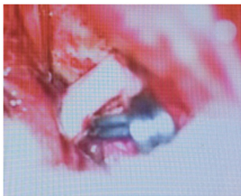
Figure 4 Intraoperative photograph showing the clipped aneurysm.