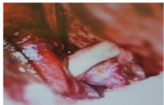
Figure 2 Intraoperative. Before adenosine-induced flow arrest. Aneurysm with increased tension in the wall.