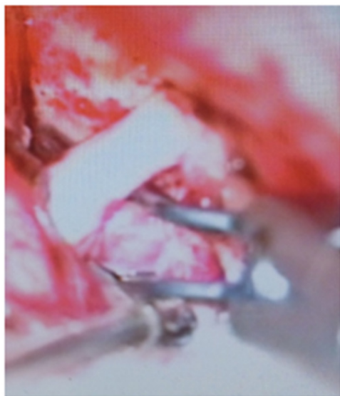
Figure 3 Intraoperative pre-adenosine-induced flow arrest. Softness of aneurysm dome and neck.