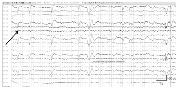
Figure 3 24-hour long EEG recording of patient 3 showed left temporal 13s long rhythmic theta runs in wakefulness (black arrow). 1Hz high pass, 70 Hz low pass filter.

MRI revealed bilateral fronto-temporal atrophy, with emphasis on the temporal lobes and significant volume loss of the hippocampi. The neuropsychological tests showed severe cognitive decline; his MMSE score was 13. The impairment of his short-term memory and visuo-spatial skills was compatible with the AD-like dementia-pattern (ACE: 36) with minimal depression (BDI II: 13) and low-level anxiety (STAI: 31, 33). We confirmed the earlier diagnosis of probable AD and started 10mg donepezil and 20mg memantine once a day. Although his standard EEG was normal, because of the short-term variability of his cognitive performance we carried out 24-hour EEG for screening. It revealed irregular, 4-6 Hz diffusely slowed background activity with rare, left temporal sharp waves and occasional left temporal 6-15 s long rhythmic theta runs both in wakefulness and in sleep, consistent with electrographic seizures (Figure 3). We added 500mg levetiracetam twice a day to his anti-dementia medication. One week later his home caregiver reported improvement in his cognition and memory function, but he started to deteriorate again after 3 weeks. Because of the worsening the caregiver suspended the antiepileptic treatment. The patient was lost to follow up.