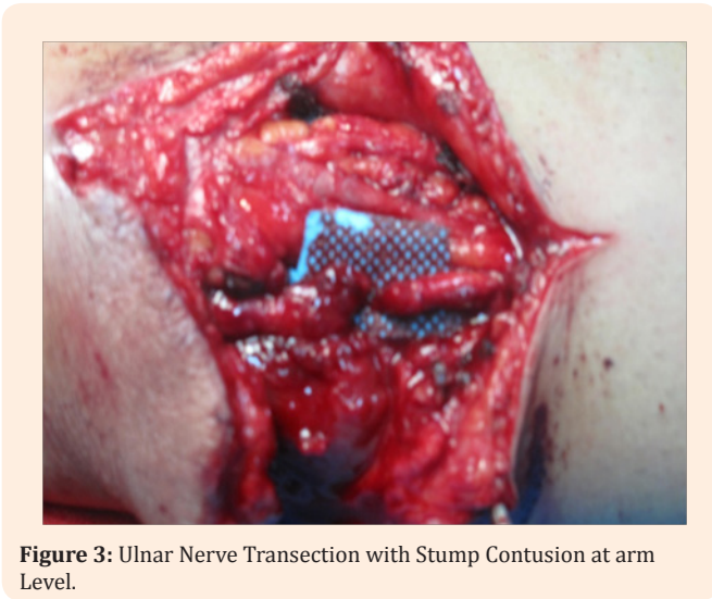
Figure 3: Ulnar Nerve Transection with Stump Contusion at arm Level.