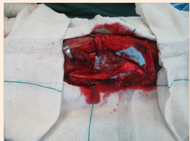
Figure 2: Ulnar Nerve Injury with Neuroma Formation.