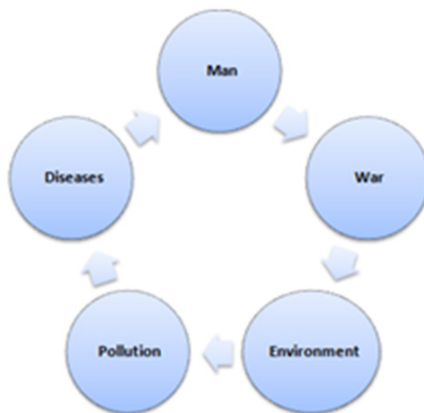
Figure 2 The Closed Cycle between Man, War, and Environment.

Received: August 04, 2017 | Published: October 12, 2017