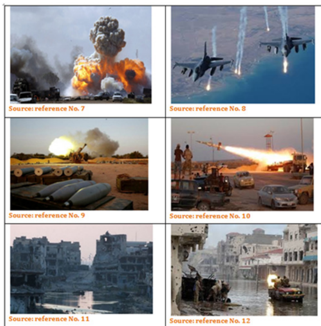
Figure 3 Libyan War in Pictures.