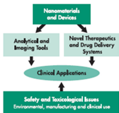
Figure 1 Science of Nanomedicine.

Nanomedicine is the one of the most auspicious application of nanotechnology. 1 The range of Nanomedicine in medical applications is from different nano-materials to nano-electronic biosensor. 2 Nanomaterials can be turned into nanomedicine by designing it with chemically modifiable surfaces to attach a variety of legends which can be used in medical applications as a new generation of diagnostics tool, biosensors, molecular-scale fluorescent tags, imaging agents, biological tools and drugs for detecting and treating complex diseases including cancer at its earliest stages and. 1,3,4 (Figure 1 & 2).