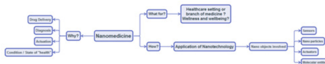
Figure 1 Blow does summarize the coverage given by the definitions discussed above.

Let’s have a look at the nanomedicine first, as a research area; what does it mean? Could this really be the first ingredient? If we start with the British Society for Nanomedicine. 5 their definition will point out that “is simply the application of nanotechnologies in a healthcare setting”. 6 will tight the nanomedicine to the wider domain of medicine (“Nanomedicine is a branch of medicine that applies the knowledge and tools of nanotechnology to the prevention and treatment of disease.”), while. 7 does assign the domain in the field of nanotechnology applications and keeps the definition quite wide - “Nanomedicine ranges from the medical applications of nanomaterials and biological devices, to nanoelectronic biosensors, and even possible future applications of molecular nanotechnology such as biological machines” (Figure 1).