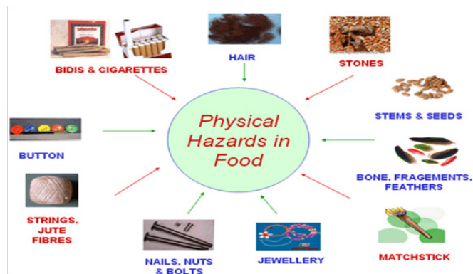
Figure 4 Physical hazards in food.

product, do not multiply, but the product cannot be decontaminated. 15 Till date a complete risk assessment has not been made for many of the known hazards. Due to production, processing, distribution and other practices as well as international trade (import and export), new hazards may emerge in addition to the existing hazards. 15,16