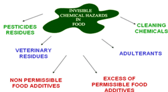
Figure 2 Chemical hazards in food.

In other words, the hazards can be categorized into chemical hazards, microbiological hazards and physical hazards. Among chemical hazards it is important to differentiate between residues such as pesticides, growth promoters and veterinary medicines and contaminants such as dioxins, polychlorinated biphenyls (PCBs) and heavy metals. Figure 2 describes the chemical hazards in food. 7 In contrast to chemical hazards, microbiological hazards are caused by living organisms. Microorganisms can enter the chain at any stage through various origins like animals, workers, environmental contamination, etc. Microbiological hazards refer to microorganisms such as bacteria, viruses, parasites, protozoa and fungi (Figure 3). They can be either toxigenic or infectious. Despite the long list of potential microbiological hazards, a few species and genera ( Clostridium botulium , Clostridium peifringens , Bacillus cereus , Staphylococcus aureus , Salmonella , Shigella and Campilobacter ), and the intestinally pathogenic Escherichia coli cause the majority of food-poisoning cases. 7 Physical hazards relate to various foreign particles not normally found in a product. Examples are metal, pieces of wood and sand (Figure 4). The nature of physical hazards in the food chain is rather different from the nature of other hazards. Besides, compared with chemical or microbiological hazards, physical hazards are less likely to affect large numbers of people. 7