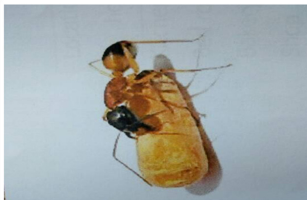
Figure 2 Camponotus consobrinus on a food particle.

The distribution of Camponotus consobrinus by location of catch.