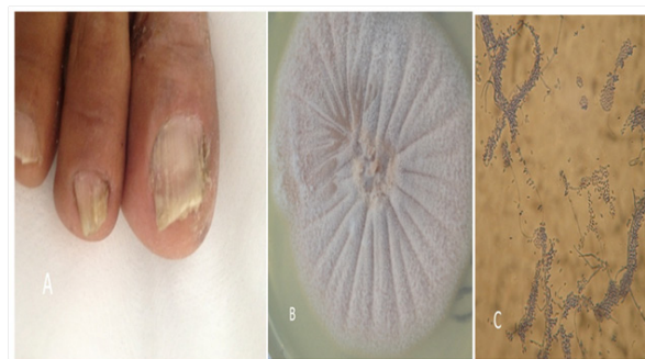
Figure 2 Example of nails affected by of Fusarium spp.

(B) Aspergillus niger colony. (C) Microscopic, conidia spores on conidiophores.