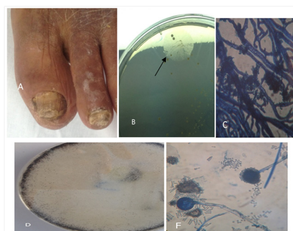
Figure 3 Example of nails affected by of Rhizopus spp.

(B) Fusarium spp. colony. (C) Microscopic curved separate macro conidia.