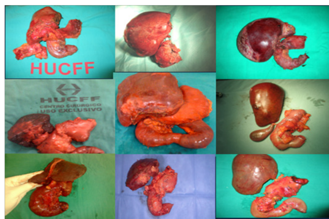
Figure 3 HPD cases.