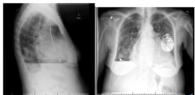
Figure 2 The radiograph depicts the air fluid level of the hydropneumothorax, as indicated by the white arrow. A minimal left pleural effusion in addition to cardiomegaly is also noted.