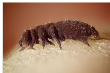
Figure 4 A tardigrade from the hot spring of California.