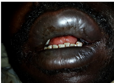
Figure 3 Shows swollen upper lip.