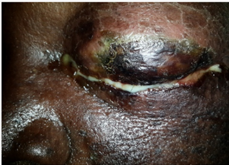
Figure 1 Shows pus discharge and proptosis in the left eye.