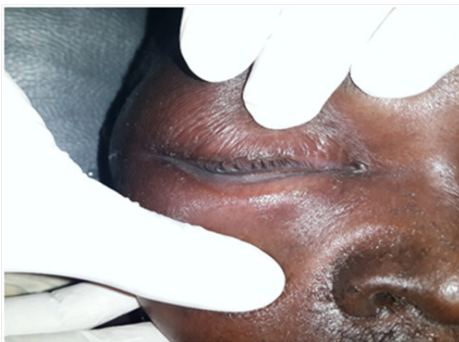
Figure 2 Shows complete ptosis of the right eye after 72hours.